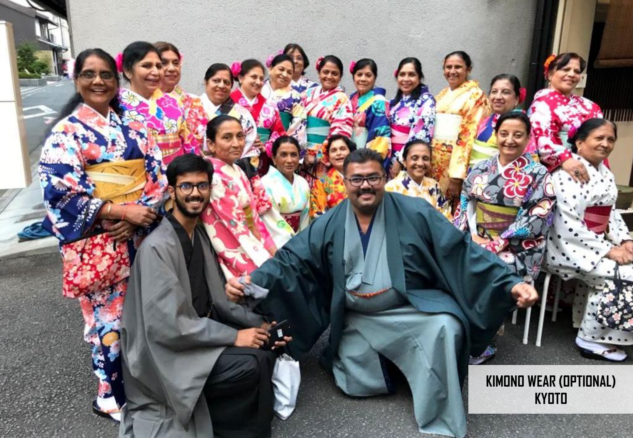
KIMONO WEAR (OPTIONAL) KYOTO