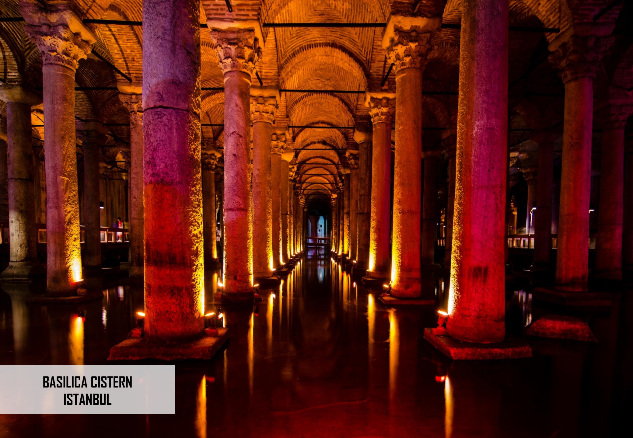
BASILICA CISTERN ISTANBUL