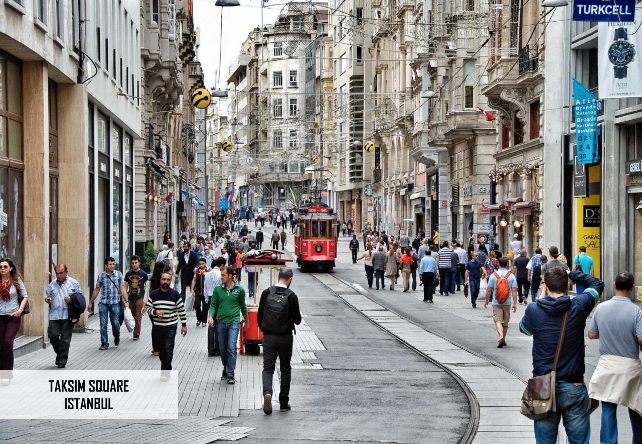
TAKSİM SQUARE İSTANBUL