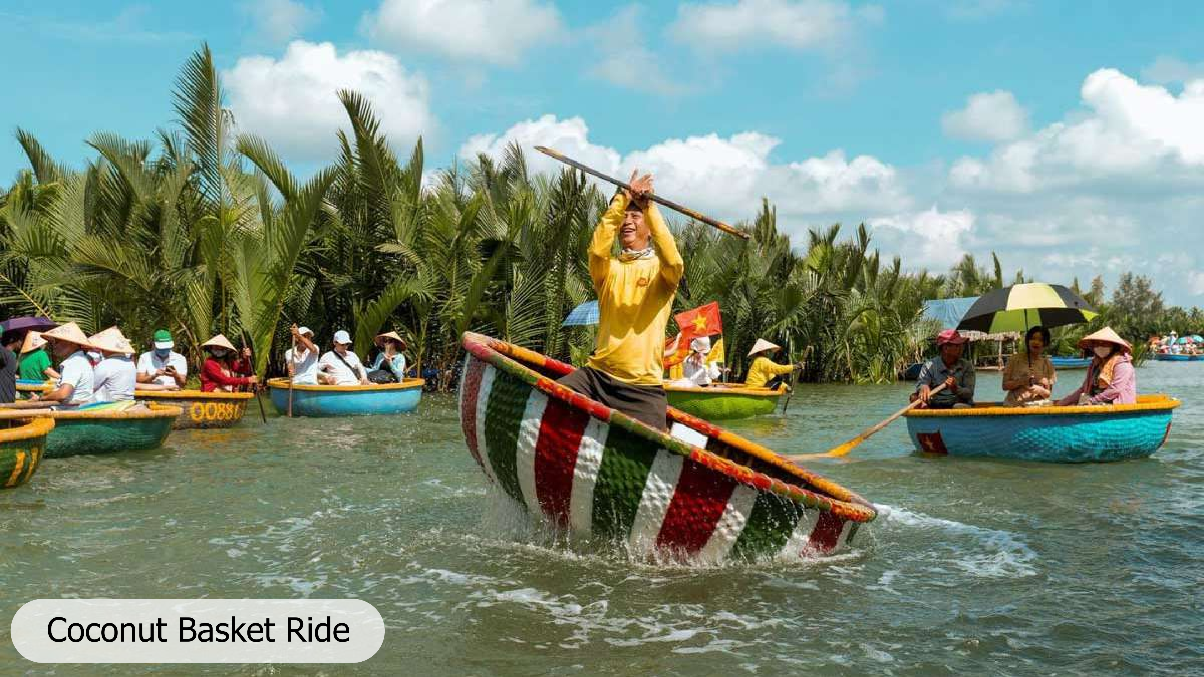
Coconut Basket Ride